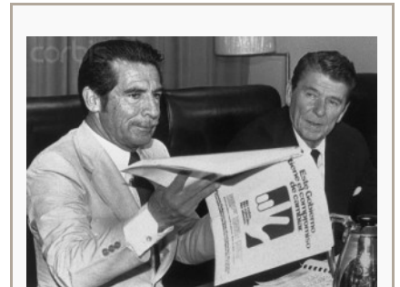
President Ronald Reagan meeting with Guatemalan dictator Efraim Rios Montt, who was later charged with genocide against indigenous populations in Guatemala’s highlands.