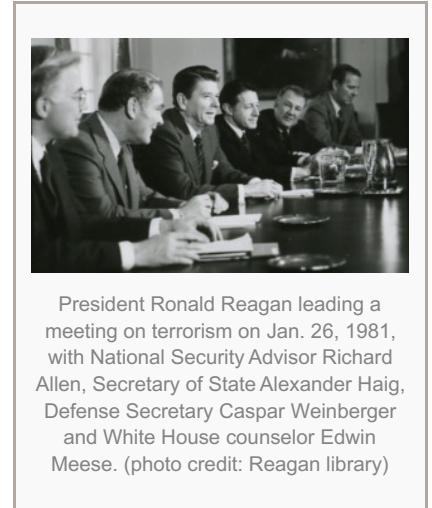
President Ronald Reagan leading a meeting on terrorism on Jan. 26, 1981, with National Security Advisor Richard Allen, Secretary of State Alexander Haig, Defense Secretary Caspar Weinberger and White House counselor Edwin Meese.