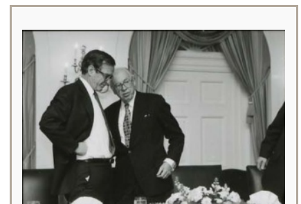
Then-Vice President George H.W. Bush with CIA Director William Casey at the White House on Feb. 11, 1981.