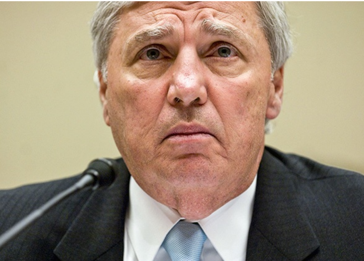
Then-FDA Commissioner Andrew von Eschenbach before Congress on April 22, 2008.

But even the Senate couldn't wring key information about the misconduct out of the FDA. "Every excuse under the sun has been used to create roadblocks," complained an indignant Sen. Charles Grassley, "even in the face of congressional subpoenas requesting information and access to FDA employees." The head of the FDA, Andrew von Eschenbach, attempted to explain to Congress why the agency didn't tell its advisory committee about the problems in the Ketek study: "After considering the fact that the investigation results were preliminary ... FDA decided to hold the Advisory Committee meeting as planned ..." without notifying the committee of the potential problems. But Rep. Bart Stupak quickly pointed to an email , which, he argued, contradicted von Eschenbach's testimony. "So either you are not being forthright with us, when I believe you are, but whoever is doing your work is trying to lead this committee down the wrong path." And the correct path showed that site after site involved in study 3014, as well as other key Ketek studies , were tainted as well.