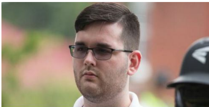
James Alex Fields, Alleged Charlottesville Attacker, Appears In Court He's accused of second-degree murder. huffingtonpost.com

Here is what we are told about James Alex Fields, Jr., 20 , the driver of the car that plowed into the crowd, killing Heather Heyer and injuring others ( Heavy.com ):