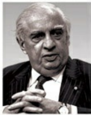
PETER SUTHERLAND GOLDMAN SACHS CHAIRMAN