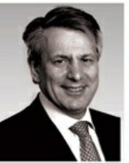
JORMA OLLILA ROYAL DUTCH SHELL CHAIRMAN