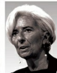
CHRISTINE LAGARDE IMF DIRECTOR