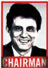
HENRI CASTRIES CEO AXA GROUP INVESTING