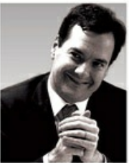
GEORGE OSBORNE CHANCELLOR OF THE EXCHEQUER