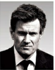
JOHN SAWERS CHIEF OF SECRET INTELLIGENCE-MI6