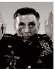
DAVID PETRAEUS FORMER DIRECTOR OF CIA