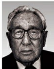
HENRY KISSINGER FORMER SEC. OF STATE