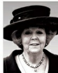
QUEEN BEATRIX OF THE NETHERLANDS