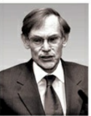
ROBERT ZOELICK GOLDMAN SACHS BOARD OF INTERNATIONAL ADVISORS