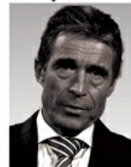
ANDERS RASMUSSEN NATO SECRETARY GENERAL