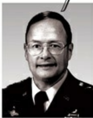
KEITH ALEXANDER FORMER NSA DIRECTOR