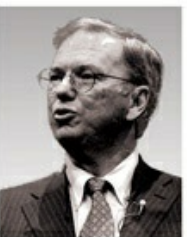
ERIC SCHMIDT EXECUTIVE CHAIRMAN GOOGLE